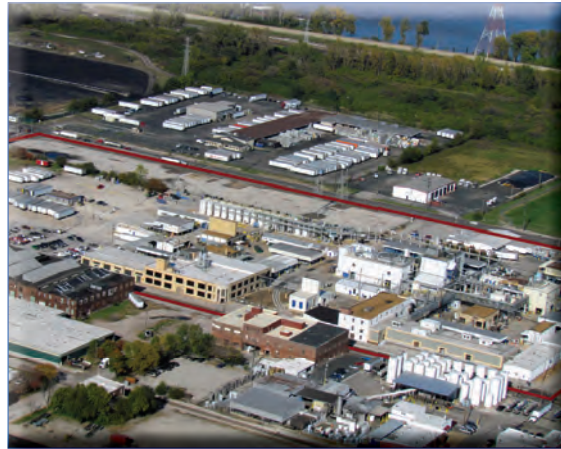
ELANTAS PDG, Inc. headquarters in St. Louis, Missouri

Many ELANTAS PDG, Inc. products are recognized as components of electrical insulation systems in accordance with UL 1446. ELANTAS PDG, Inc. is registered to ISO 9001:2000 and ISO/TS 16949:2002 - Second Edition.